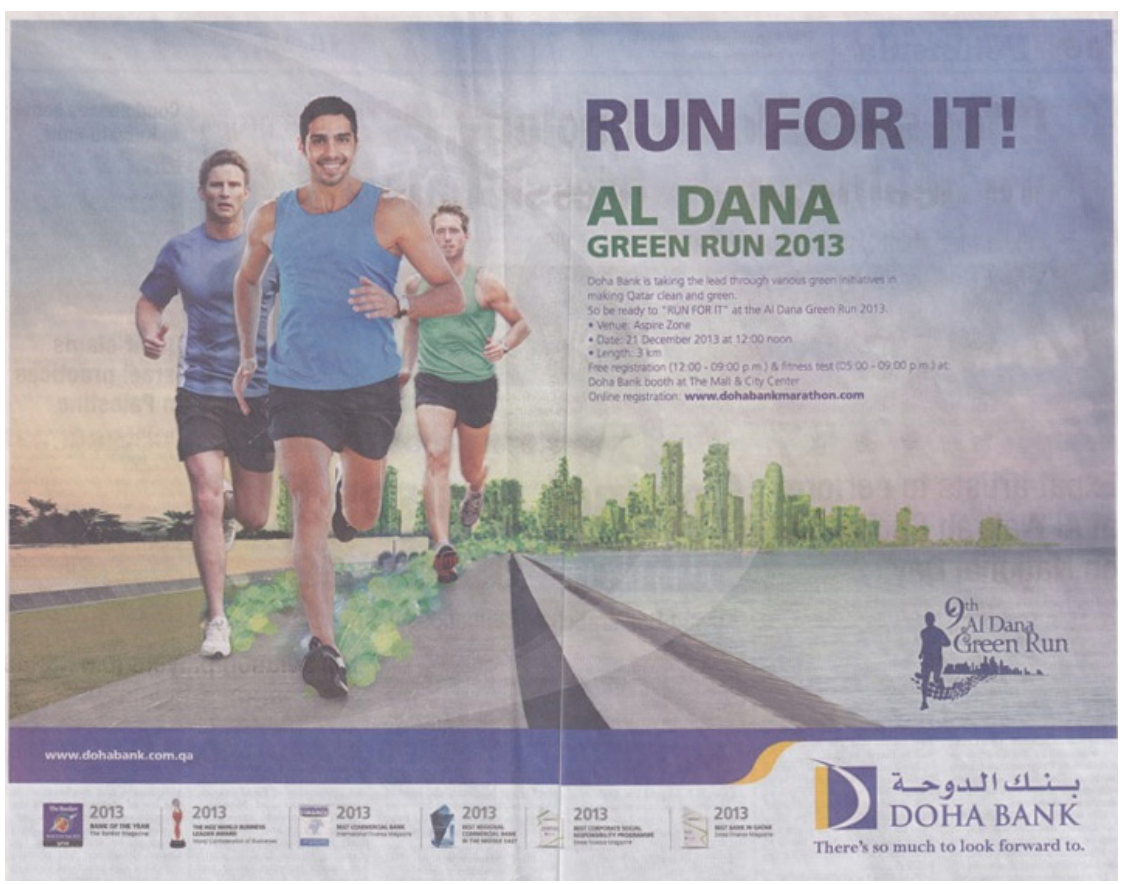
Figure 2. Doha Bank Al Dana Green Run advertisement, with green leaves used to render the Doha skyline.

And yet, the Qatari advertising landscape suggests that there is a financial incentive for corporations to advertise their products as green, and thus to express their commitment to the QNV's sustainability agenda. For example, Figure 1 shows an advertisement from Qatar Steel, which announces: "Aligned with Qatar's National Vision 2030 and corporate strategic objectives, production of 'SUSTAINABLE STEEL' is expected to reduce CO2 emissions and recycle wastes, thereby, protecting the environment and enhancing the core brand value." Selling a company's image through the language of greening Doha is also readily apparent from the various activities of Doha Bank, which more overtly uses the language of CSR. Ranging from their sponsorship of the annual "Al Dana Green Run" to tree planting activities, the company proudly claims to be "taking the lead through various green initiatives in making Qatar clean and green" (see Figure 2). Dr. R. Seetharaman, the Chief Executive Officer of the Doha Bank Group elaborates: