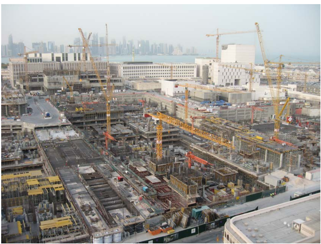
Figure 3. Mshereib downtown redevelopment construction site in December 2013.

The synecdochic strategy of building the "exemplar" is readily apparent in two major state-funded projects in Doha, which are framed as prototypes of high-tech building for Qatar's ecologically-sustainable future. The first, the Msheireb downtown redevelopment, is a complete transformation of a huge swath of Doha's core, near the Souq Waqif (see Figure 3). There is