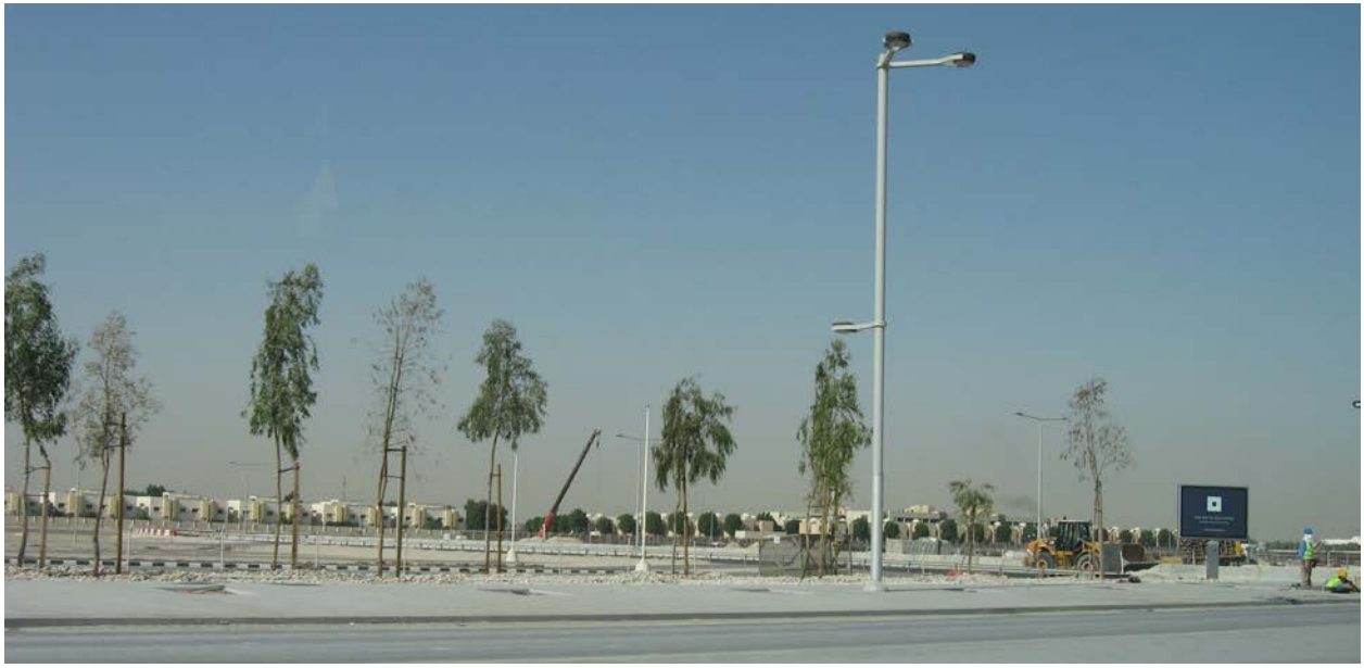
Figure 5. Trees at the Lusail construction site, December 2013.

landscape absolutely overflowing with lush vegetation. This contrasts sharply with the present-day view of the city, where it is clear that someone was told to plant trees, but no one was assigned to water them (see Figure 5).